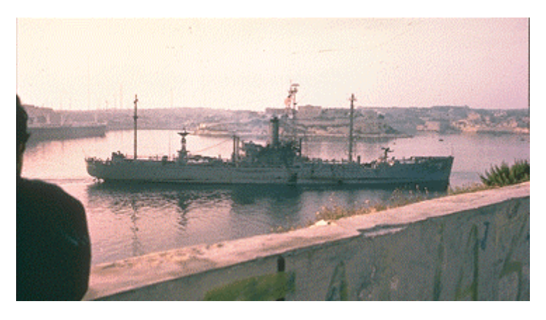
Figure 4 USS LIBERTY silhouette.<sup>21</sup>

Additionally some of the Israeli versions of the attack claim the LIBERTY was mistaken for the Egyptian motor vessel, El Quesir. The two vessels were not similar. The key silhouette features that distinguished one from the other include the antennae arrays and the differing superstructures. LIBERTY was approximately twice the length of El Quesir. The Israelis probably knew that El Quesir was in Alexandria during the entire Six-Day War. Alexandria is 250 miles from where LIBERTY was patrolling, 24 hours steam away.<sup>20</sup> Comparison may be made below.