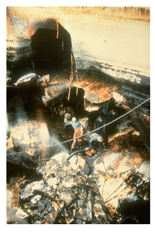
Figure 3 View of torpedo hole below waterline.<sup>42</sup>

<sup>1</sup> James M. Ennes, Jr., Assault on the Liberty: The True Story of the Israeli Attack on an American Intelligence Ship, (New York: Random House, 1979), 3.