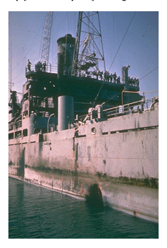
Figure 2 The very top of the torpedo hole.<sup>32</sup>

Your flash traffic received. Sending aircraft to cover you. Surface units are on the way. Keep [situation reports] coming.<sup>31</sup>